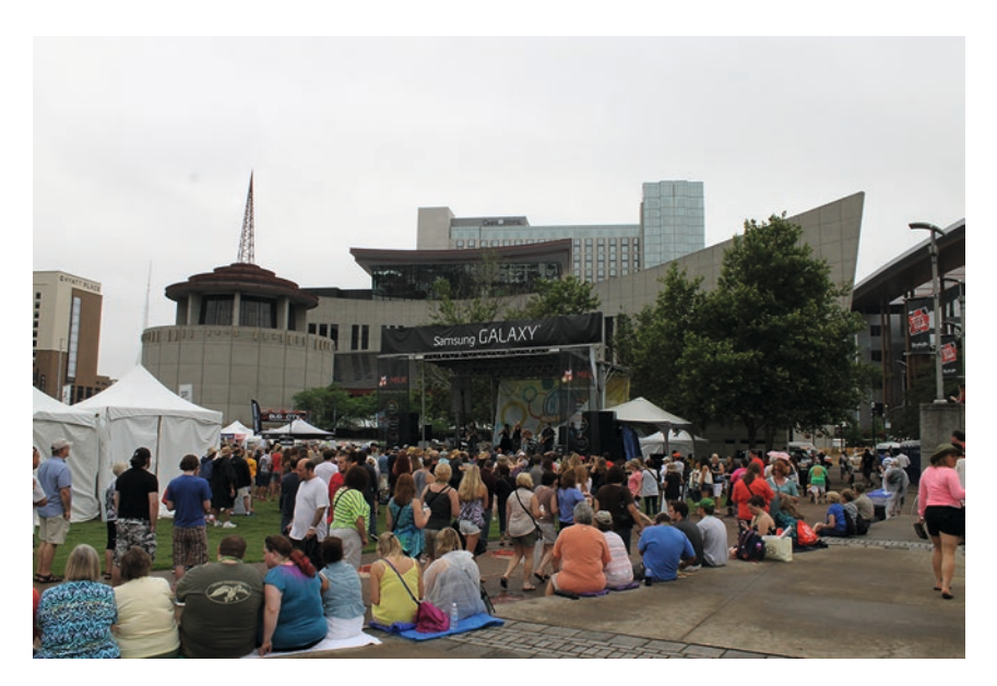
Fig. 6.1 Performing in the shadow of country-music history (Photograph by author. June 6, 2014)

by connecting the past to the present through sonic, thematic, historical and geographical means. A festival geographically separated from the history and the city being celebrated may be interpreted as something new or in contrast with the conflicting space, but when a festival takes place in the shadow of history, surrounded by the city and landmarks that fans associate with the tradition and the city, each annual celebration becomes part of that history and is validated through its placement. During the CMA festival, new music that is heard from festival stages located within the downtown area is, therefore, validated as part of country music through its very presence within the performative space of the city. In other words, music played for country fans in the shadow of the country-music tradition and in the heart of the city from where it developed and is perpetuated becomes "authentic," regardless of its sound. The following image from the 2014 festival, for example, shows that the temporary Samsung Stage has been placed directly in the shadow of the Country Music Hall of Fame (Fig. 6.1).