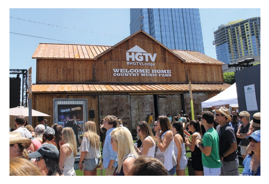
Fig. 6.3 Welcome home country-music fans (June 10, 2016)

A sign on the barn facade reads: "Welcome Home, Country Music Fans," reminding country-music tourists that the festival is for them and that they are a crucial part of the country-music family. The recurring theme of home and family at the festival and the invitation to perform country music and all that it signifies result in an experience of belonging to and a heightened eminence within country-music culture.