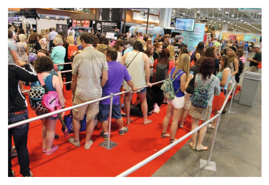
Fig. 6.10 Waiting for autographs (Photograph by author. June 9, 2014)

autographs, the ultimate souvenir in popular culture. Like the vendors on Lower Broadway, standing in line to obtain an autograph becomes a social space to share thoughts on country music and to trade stories about interaction with artists and past festival experiences. In addition, the act of waiting for and meeting an artist becomes an act of dedication.