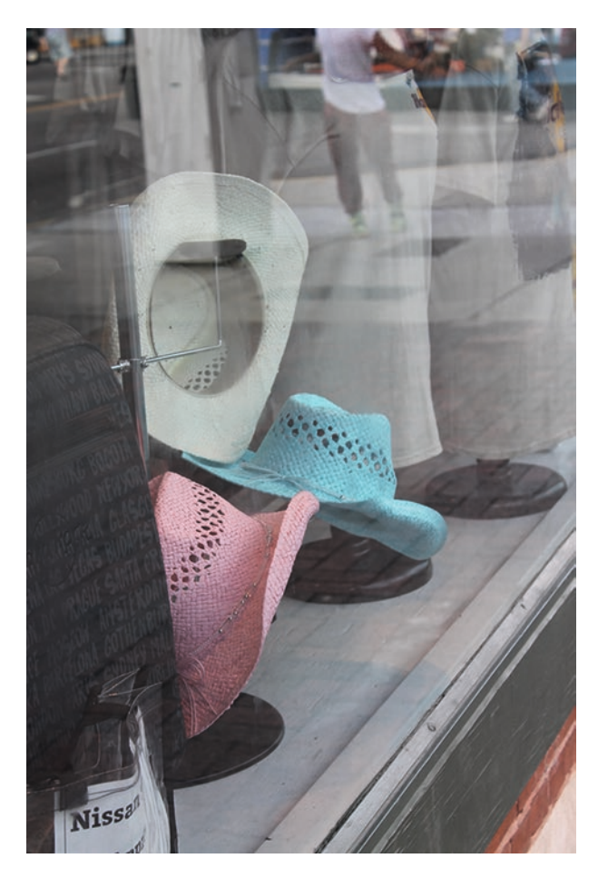
Fig. 6.6 Window shopping (June 8, 2014)

The transformation that occurs during the CMA Music Festival, like that of Helldorado Days, provides a liminal space between reality and fabrication, shifting social constructs and assigning ownership to countrymusic fans. This heightened role allows tourists to perform the role of the "local" and/or a "true" country fan. For most of the year, an ensemble of a neon straw hat, tank top, and shiny, un-scuffed boots would clearly indicate one is an outsider, a visitor to Nashville drawn to the local boot store's kitschy advertisements and country-music stereotypes, a heartfelt