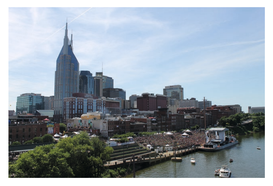
Fig. 6.4 Gazing at the festival (Photograph by author. June 9, 2016)

Nashville's first skyscraper built in 1957 by Life and Casualty Insurance, a company also largely responsible for the birth and broadcast of the Grand Ole Opry. To the right of the L&C Tower is another skyscraper that serves as the Country Music Television (CMT) headquarters, a media company partly responsible for the modern dissemination of Nashville's music and the recent savior of the Nashville television show after its ABC cancelation. In this one photograph, Nashville's past and present, backstage and frontstage, real and fabricated merge. Country-music festivals are held around the globe, but attending a music festival in Nashville offers fans the opportunity to interact with so much more than the countrymusic celebrity and/or sound. The CMA Festival offers the chance to interact with the city and the culture that gave rise to the music, artists, and myths being celebrated during the ritual. Like the presentation of the city itself, the festival experience is realized through the invitation to mediate via one's own participatory performance the many dualities that unfold in the city and that are represented in the above picture. The following discussion of festival regalia reinforces the performative nature of the event.