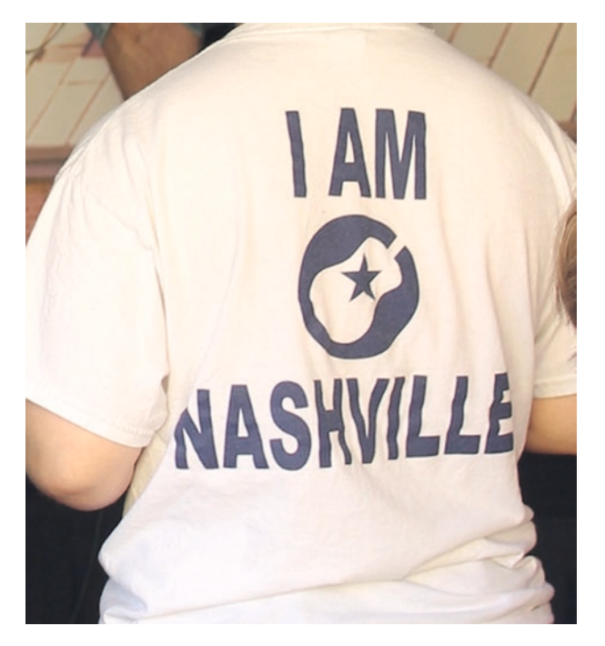
Fig. 6.8 I am Nashville (Photograph by author. June 10, 2016)

of favorite characters. In her 2011 article "Stranger than Fiction: Fan Identity in Cosplay," Nicolle Lamerichs argues that "Cosplay is a form of appropriation that transforms, performs, and actualizes an existing story in close connection to the fan's own identity" (Lamerichs 2011, p. 1). At the CMA Festival, the almost mandated stereotypical country dress seems less of an attempt at replicating a named character or star and instead an attempt at a performance of a caricature of one's self or of the preconceived country-music persona. Dressing up for the festival performance is a signifier to other participants that fans have left reality and their "real" selves behind in favor of a liminal existence through a performed persona of one's desired self rather than the reality of one's life. Through the festival performance of locality and desired identity, fans leave their lives behind, replacing them with a shared identity available only through the festival and among other dedicated country-music fans.