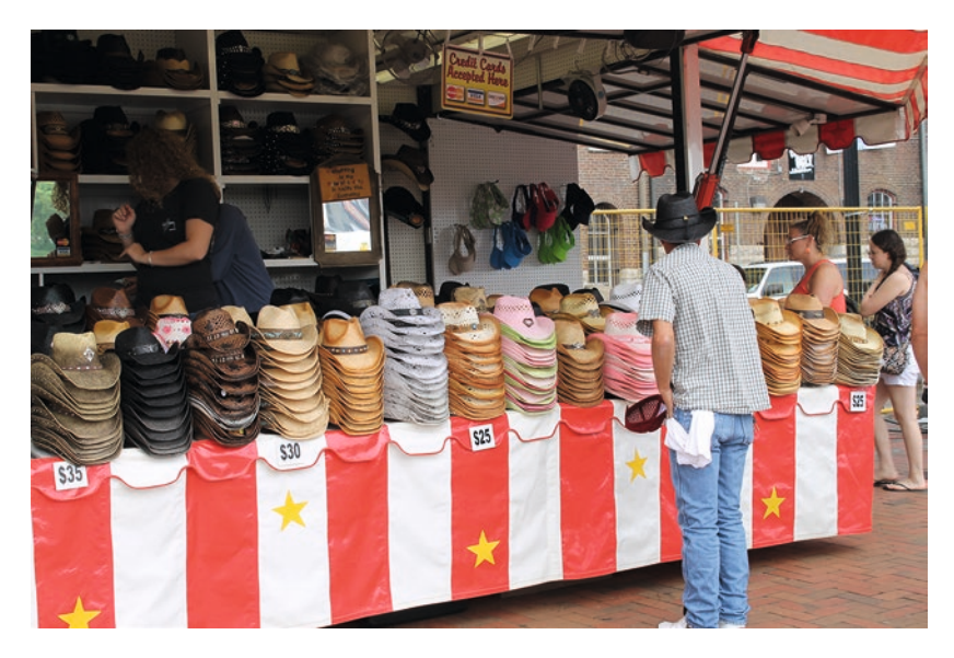
Fig. 6.5 The perfect hat (Photograph by author. June 8, 2014)

The use of such outfits, for both men and women, may be compared to masks and costumes in more traditional festivals and rituals. Wearing such clothes, talking and behaving a certain way are all means to disguise one's everyday image and adopt a completely different persona...perhaps who they want to be in their dreams. The festival is a liminal space and time and the costume and the pretense that goes with it are the means for a temporary transformation. (Frost and Laing 2015, p. 219)