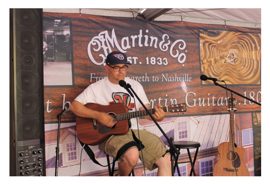
Fig. 6.9 Performing on Broadway (Photograph by author. June 11, 2016)

bar in the middle of Lower Broadway and waited in line with other fans to perform my own song and momentarily become the performer at the Martin Guitar Tent (Fig. 6.9).