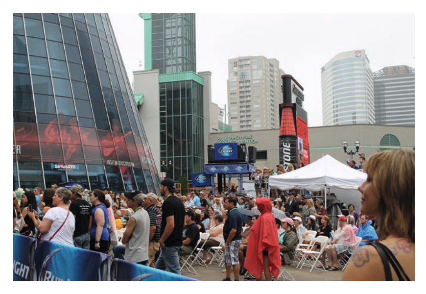
Fig. 6.2 Fans watch a performance at the Budweiser Stage (June 7, 2014)

pantheon. The stage's name also reinforces and validates the real Tootsie's and its storied connection to country music. The "alley" mentioned in the temporary stage's title not only references the stage's location at the festival but also in the city: the nearby Ryman Alley is an alleyway between the two buildings; it physically and symbolically joins the Ryman and Tootsie's by offering both back-door access to the club and a backstage entrance to the Ryman. The two sites' close proximity in a shared back region of Nashville creates a historical connection between the two which extends to the fan experience: Like the country musicians who are rumored to have frequented Tootsie's during the intermission and after Opry shows over the years, fans can enter the honky tonk through the back door via the alleyway and, in the process, step into the back region of Nashville history. The historical shadow of the Ryman Auditorium, the architectural design and mission of the Country Music Hall of Fame, and the vibrancy of the many Lower Broadway honky tonks solidify the connection between current country music performed live at the festival and the history of country music still alive in Nashville. While landmarks provide