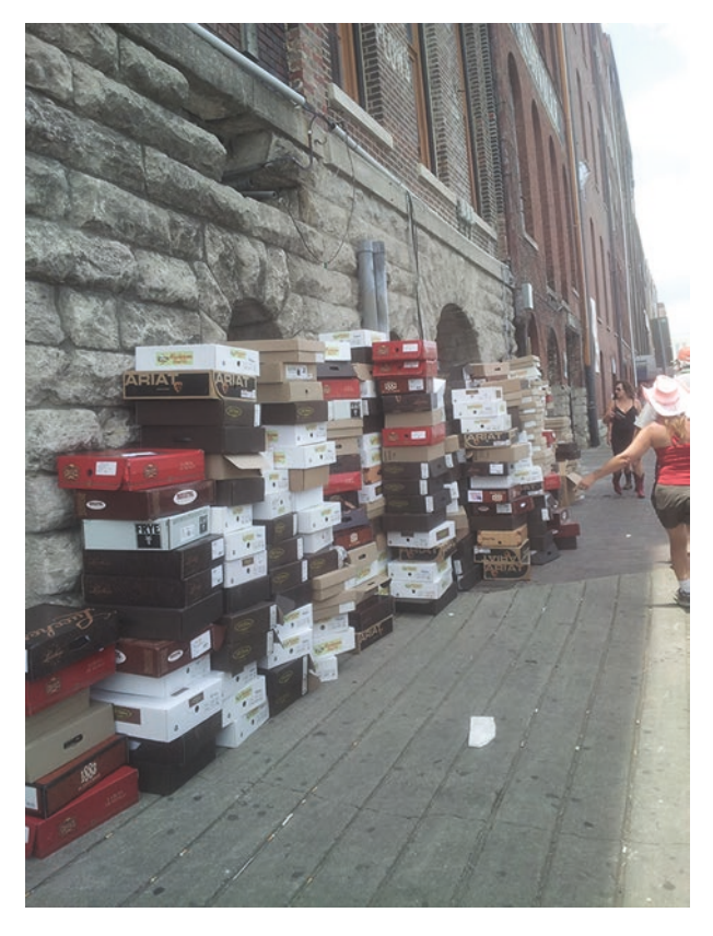
Fig. 6.7 Discarded boot boxes (Photograph by Tristan Jones. Reprinted with permission from the photographer. June 8, 2012)

attempt to blend in with what one thinks is the local culture. During the festival weekend, however, such costuming becomes both expected and the norm, and it is the local who stands out within the festival culture as oddly outside the temporary community being performed in the theatrical space that is downtown Nashville. Several fans attending the 2015 festival explained to me that they had bought clothing for souvenirs and to wear at the festival to blend in with other tourists. Reagan, a fan and longtime attendee of the CMA Festival, when asked about what type of souvenirs she purchased, answered simply: "cowboy hat and